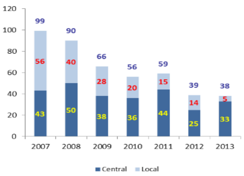
Fig. 1. Number of government decisions on allocations from the reserve fund Source: Fiscal Council Report on 2013

accompanies allocating these amounts from the moment of discovering the necessity state regarding expenses incurred during the budgetary exercise until the payment for which they were requested" (CCR/ Decision no. 558, 2012). The amounts granted from funds mentioned above have a free and general character. They are granted without implying an obligation to be reimbursed, with no control on the final objective allocation provided in the law, not being stipulated a targeted, specific, destination, but only the phrase "current and capital expenditure". Therefore, funds being depersonalized often appear imperfections/ interpretation and bias in their allocation. An evolution of the number of Government decisions on allocations from the reserve fund, in 2007-2013, is shown using a chart below (Fig. 1).